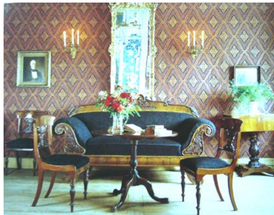
Figure 3 Nordic interior layout

From the 1930s to the 1950s, Nordic furniture design was legendary development, the unique Nordic "functionalism" concept is also perfect during this period, and the emergence of a number of furniture designers, driven by these masters, Nordic countries of the furniture design gradually formed a relatively uniform style and swept the world. Today, Scandinavian designers and manufacturers are no longer focused solely on the appearance of furniture, but rather focus on presenting the designer's unique style. For a long time, the "Nordic Design", which is known as "concise, comfortable and modern", is indeed a style that can not be overlooked in the world design field. To understand this style in a comprehensive way, Style behind the reasons, because a regional design style is produced by the region's natural environment and social factors and other conditions. Now, the Nordic furniture design concept everywhere, its furniture brand modern and practical style quickly occupied the furniture market, what is the reason for the Nordic furniture in just half a century so deeply rooted it? This article will analyze the reasons for this.