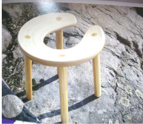
Figure 6 "horseshoe-shaped" sauna stool

rationalist principles. But Norris Nami's sauna stool quickly became a unique example of a unique integrated modernist and traditional. The simple design of this stool is closely linked to its use. It has a visible node can be directly, it is obvious that people think of folk art. Bathing as an important industry in Finland, and the placement and use of this sauna chair, both the performance of the natural purity of the Finnish furniture without modification of the original also showed the development of society and the degree of modernization.