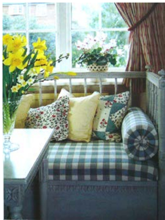
Figure 2 Nordic interior layout