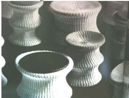
Figure 5 "Mushroom Series" seats

The "Mushroom Series" seat designed by Elohano (Figure 5) shows the Nordic designer's attention to the local material. In 1954, Elono had a chance to learn to knit baskets and, by chance, find that inverted baskets could be used as a good seat, which was the inspiration for the birth of the famous "Mushroom" series of seats. The use of the rattan in the furniture design, is a breakthrough material, and "inverted basket" shape more of this breakthrough to increase the wonderful place. "Mushroom" chair of the birth and the advent of its series of products and the Nordic furniture in the world to show its local character of a sign.