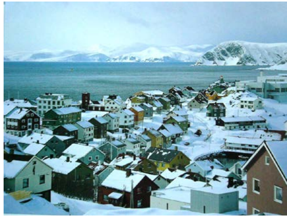
Figure 1 Scandinavian scenery

of furniture arranged a sense of harmony. In fact, through this arrangement, each furniture can show their own style.