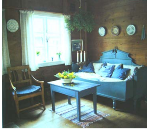
Figure 4 Nordic birch furniture

traditions and actively taking measures that include preserving crafts traditions and using indigenous materials. The Nordic forest coverage is extremely high, and the Nordic early life tools are made from birch. (Figure 4), while the traditional elements of furniture technology and materials along with the development of production in the region at the same time, and gradually led to the people of the region's existing design respected.