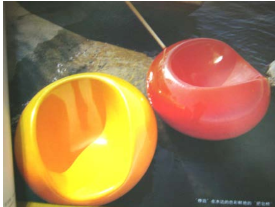
Figure 8 Soap chair

Aloeño in the 001 chair after the design of unique "soap chair" (Figure 8), which is full of creative and childlike seats, but also a bold exploration of the furniture materials and colors, advancing the Nordic The development of furniture design style. "Soap chair", also known as "baby chair", it can be viewed from any angle, and has a sense of beauty. In the basic composition of the product, "soap chair" than the minimalism even more concise, than the Nordic counterparts designer window works more concise. This legless seat is made of glass-reinforced polyester fiber, only for two parts of the forging, it has the characteristics of modern art, but also humor to show the shape of candy or bubble gum, in addition to bright colors are more Add a modern effect. "Soap chair" is a modern rocking chair deformation, from the appearance point of view, like a piece of thumb on the printed candy. "Soap chair" is not only a designer of the Nordic modern furniture, an important innovation, but also relative to the whole world.